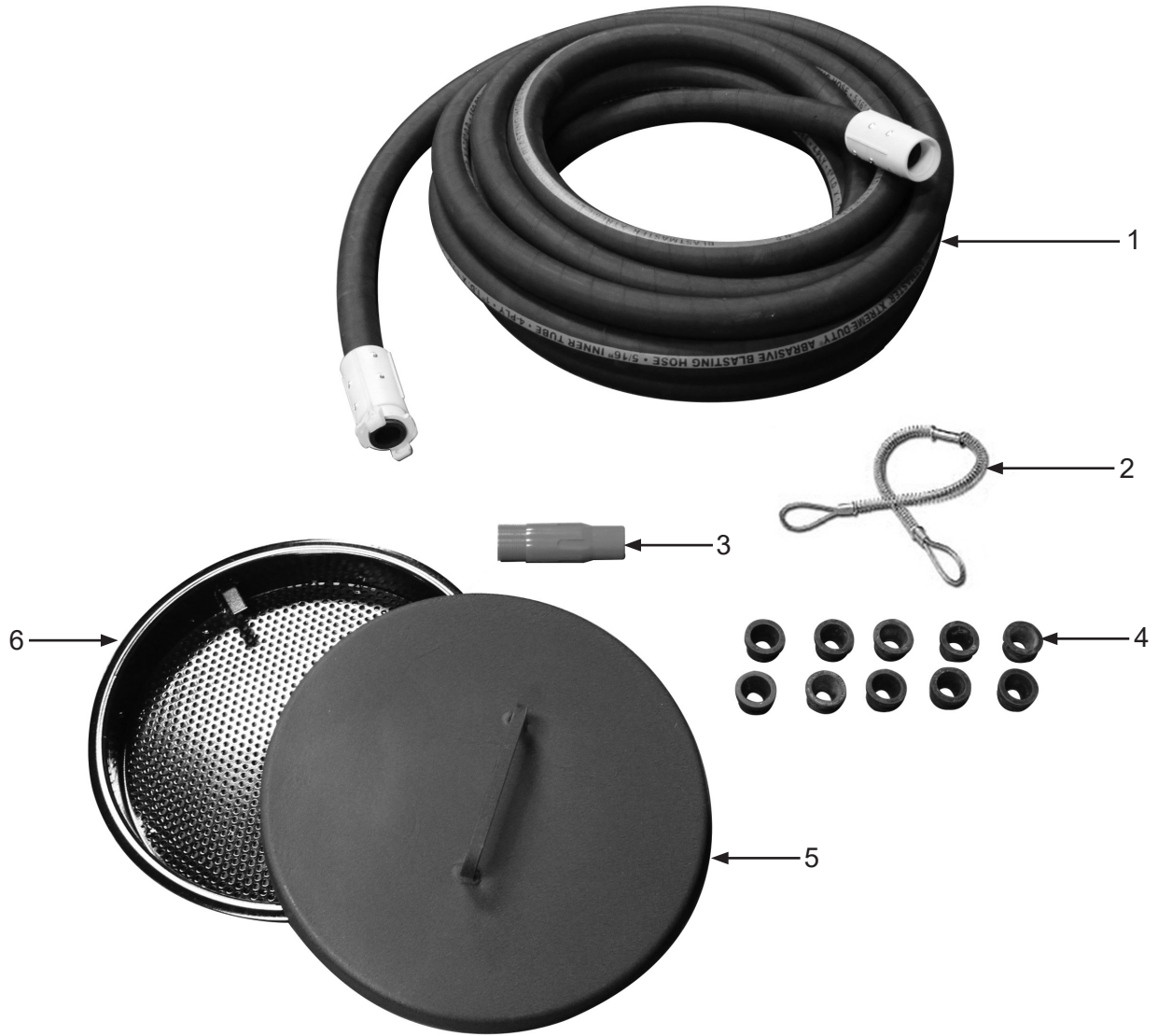
Figure 3: Abrasive Blasting Pot Package for 18" Diameter Abrasive Blasting Pots