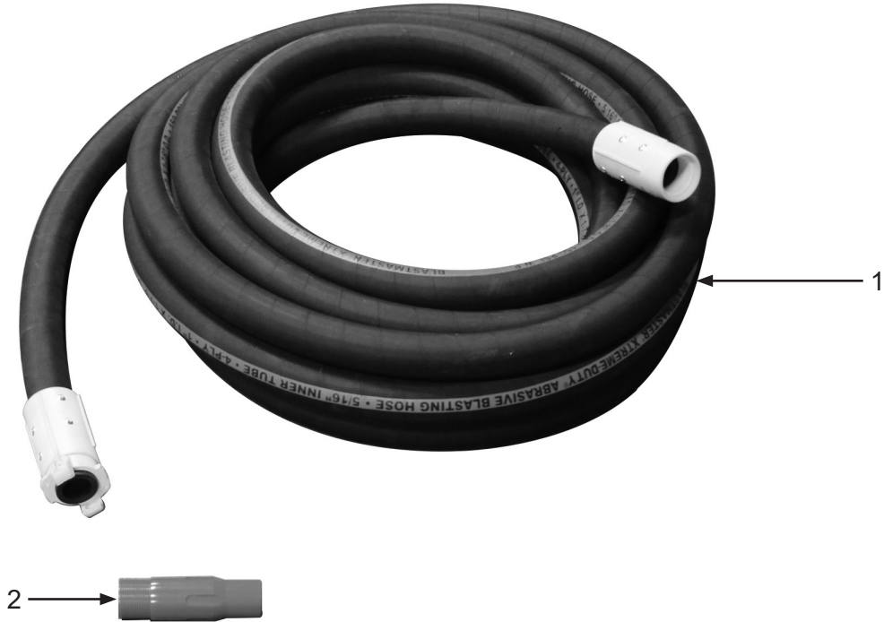
Figure 5: Hose, Nozzle, and Couplings Package 3B