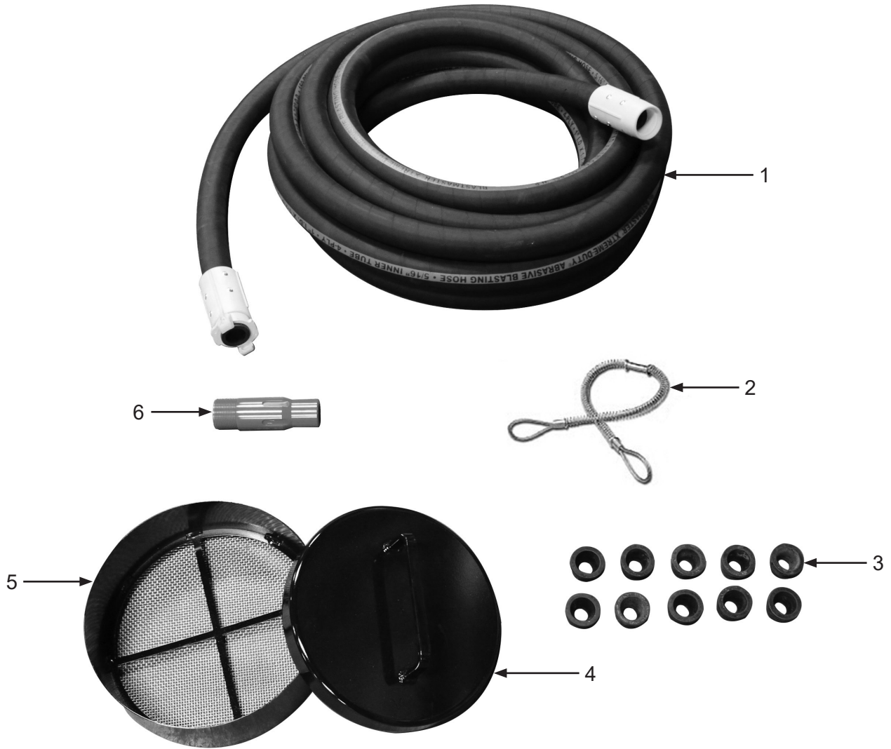
Figure 1: Abrasive Blasting Pot Package for 10" Diameter Abrasive Blasting Pots