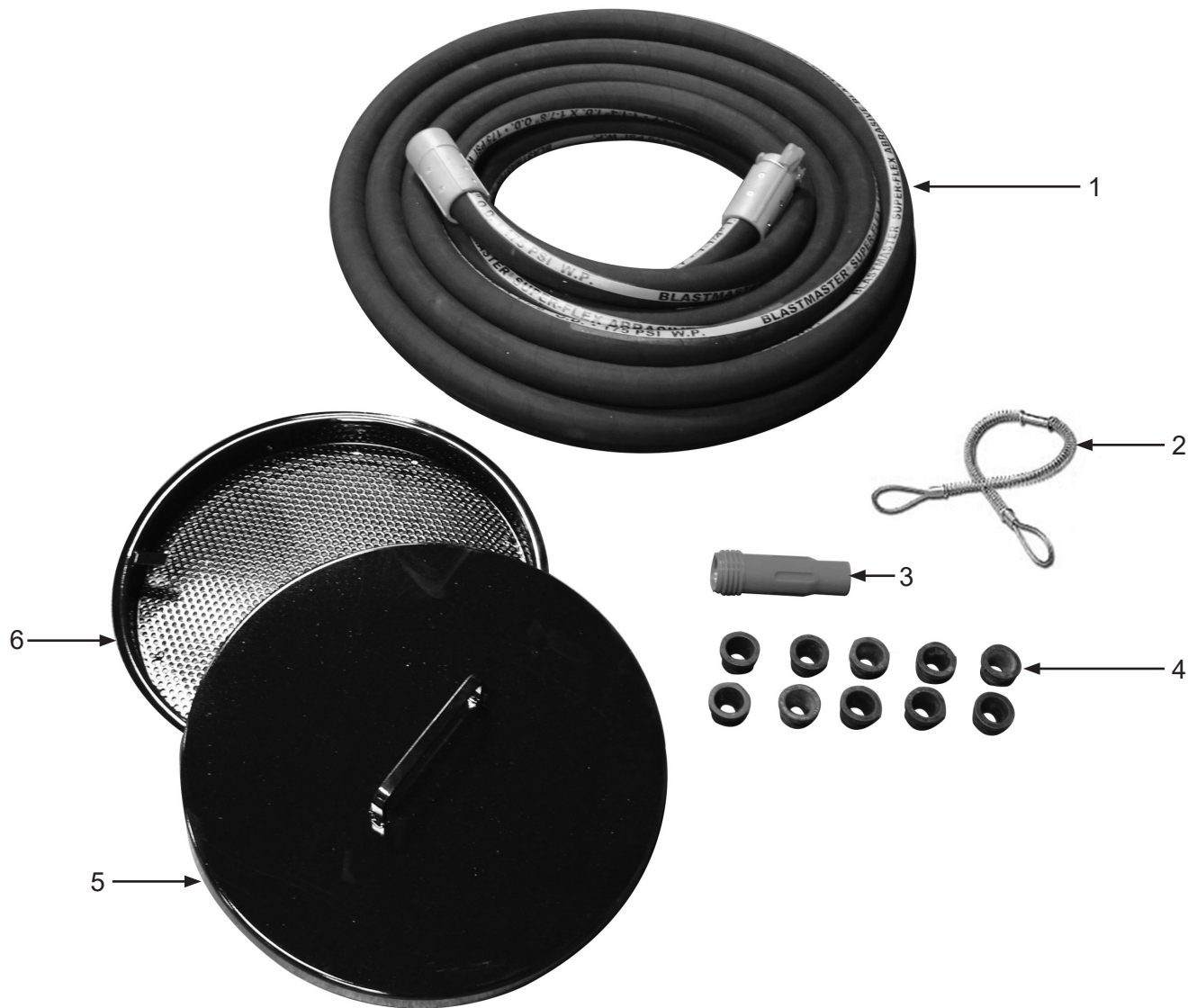
Figure 4: Abrasive Blasting Pot Package for 24" Diameter Abrasive Blasting Pots