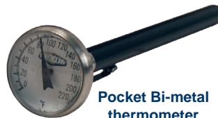
Pocket Bi-metal thermometer