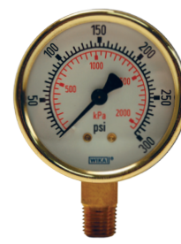
Brass Standard gauge