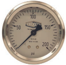
Stainless Steel center back mount gauge