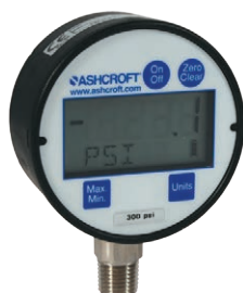
General Purpose digital gauge