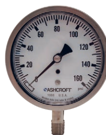
Stainless Steel Standard gauge