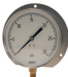
Contractor Pressure gauge