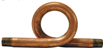
180° steam gauge siphon