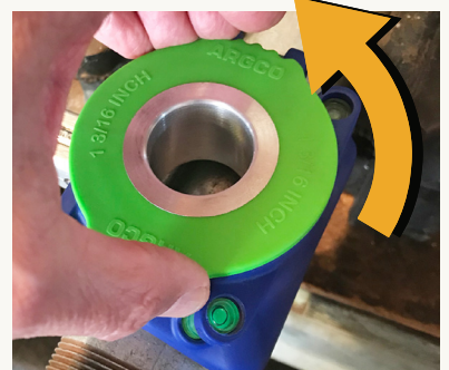
PATENTED* “QUICK CHANGE” HOLE GUIDES Insert & Quarter Turn