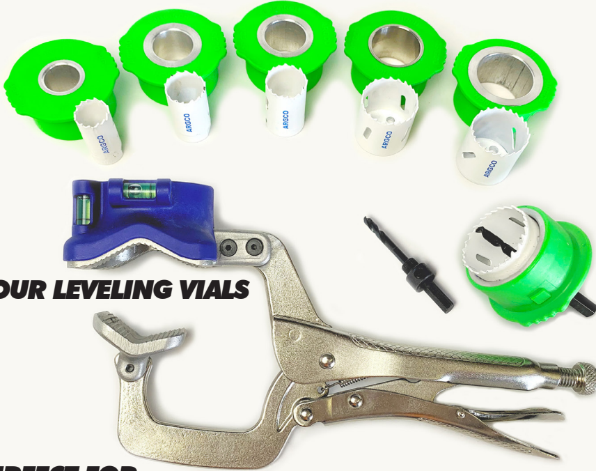
FOUR LEVELING VIALS

LIGHTER, FASTER, EASIER than previous models