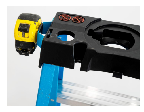
With the HAP Carrier Clip, your tools are securely held and easily accessible from your step ladder.