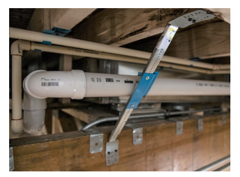
Overhead pipe installation in-between joists and beams