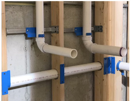
Using Stud Mounting Braces with HAP SuMo Hangers brings speed and versatility to pipe installation