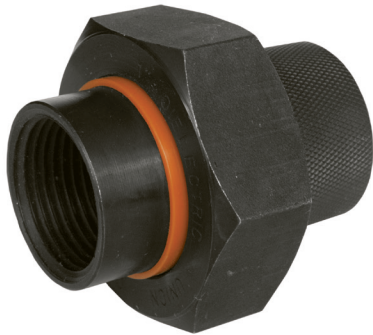
Black Iron FIP x FIP