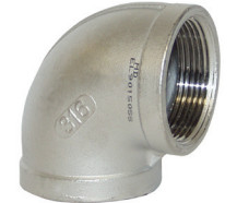
150# 316 stainless steel