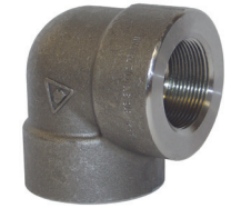
2000# forged steel