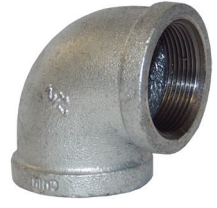
150# galvanized iron