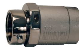
polished, chrome plated