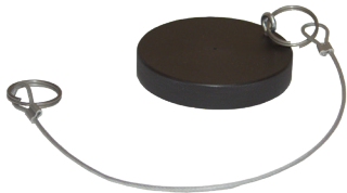
Dust Cap for Adapters

NOTE: For flange dimensions, diagrams, and additional information, please reference dixonvalve.com .