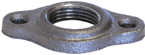
Fig. 1133 Waste Nut (Class 150 Standard)*